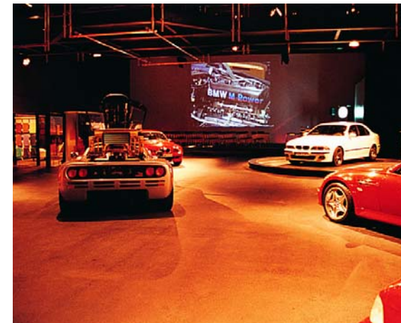
BMW Motorsport, M Studio - Germany