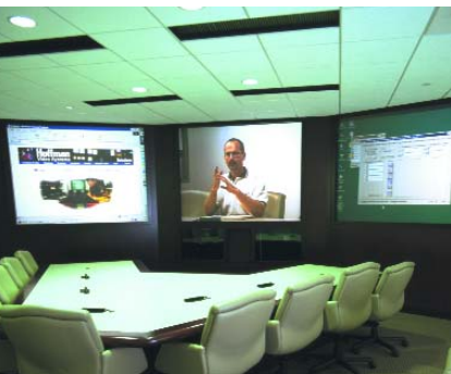
Wellpoint Boardroom - N.A.