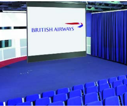
British Airways, Waterside Project - UK