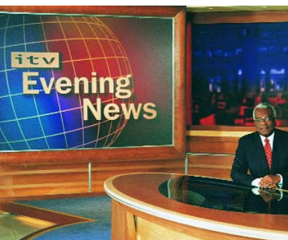
ITV Evening News - UK

If image is everything to you, then the new Vista X3 has everything you need. More than 1 billion displayable colors can be re-created to project the most resplendent and striking visuals, courtesy of the very latest in 3-chip DLP™ technology.