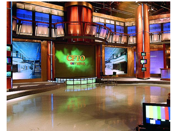
CFTO News - Canada