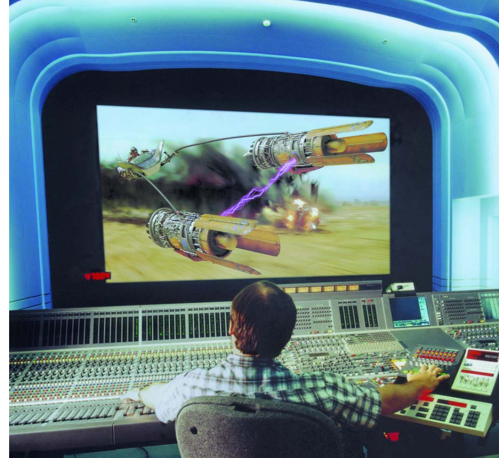
"The Phantom Menace", Lucasfilm - USA

We would never offer our clients image without substance and the Vista X3 is brimming with features that make for both simple and complete control of your presentations. Furthermore the Vista X3 offers reliability and serviceability second to none. So the Vista X3 makes your images look great, but makes you look even better.